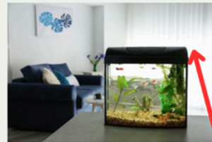
Cover fish tanks, terrariums and small cages.