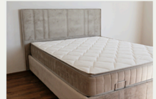
Remove all bedding from mattress & boxspring. Run through a hot dryer cycle for 40 min.