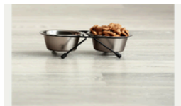
Empty pet food containers