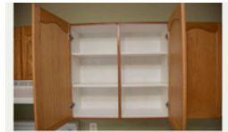
Empty and clean cupboards