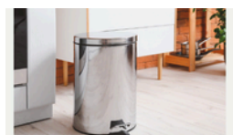
Keep garbage clean & covered