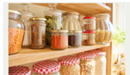
All food needs to be in sealed containers.