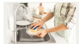
Clean kitchen before bed each night