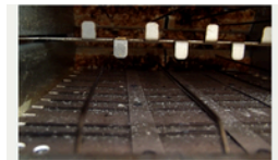
Clean inside of toaster